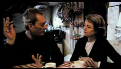
BROOKLYN / PAUL AUSTER / FEBRUARY 2009