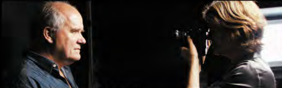
ROLES REVERSED / PETER LINDBERGH IS THE SUBJECT !