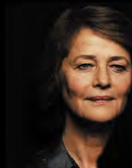
PARIS / PHOTO DURING THE SHOOT / PETER LINDBERGH / 2008