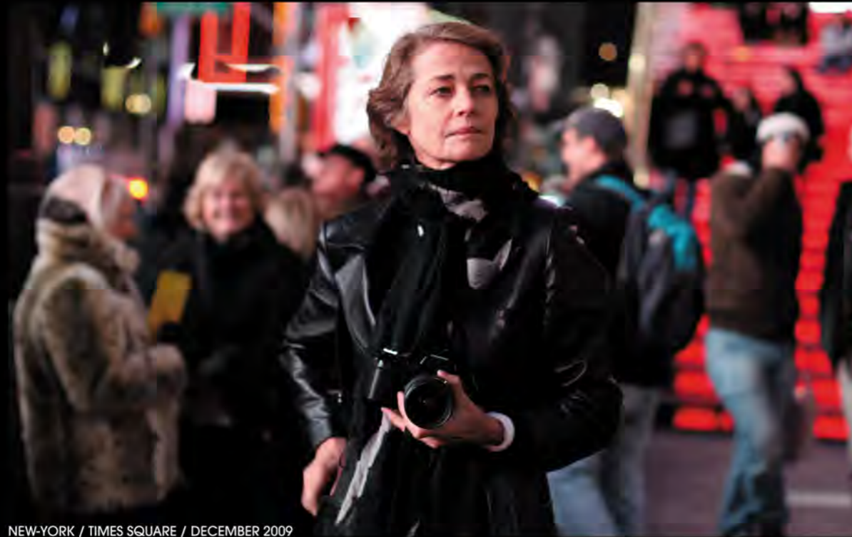
NEW-YORK / TIMES SQUARE / DECEMBER 2009

Breaker of taboos, icon avant-gardist – to capture the persona Rampling is a cinematic adventure that can only succeed by being as brave as she has been throughout her career. Staged in countless films and photographs as the classic “object of desire”, THE LOOK takes on her perspective, we see the world through her eyes. Far beyond anecdotic trivia or linear biography Rampling fearlessly fathoms the major questions of life with companions, soul mates such as Peter Lindbergh and Paul Auster.